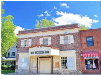
Tappahannock's DAW Theatre