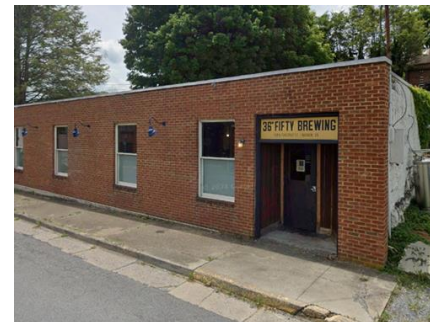
Marion's 120 N. Chestnut Street