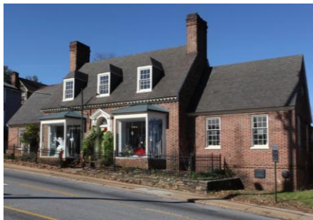
Lynchburg's 409 Fifth Street