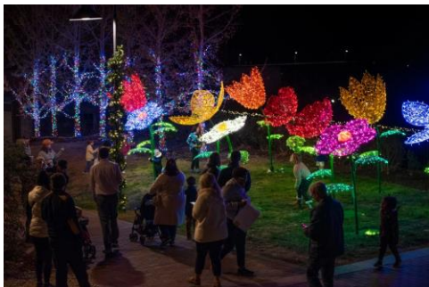
Downtown Lynchburg Association's Bright Nights on the Bluffwalk Project