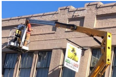
Downtown Blackstone, Inc.'s Façade Improvement Grant Project