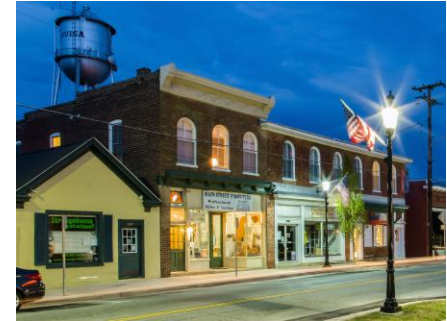
Louisa Forward Foundation's Strategic Market Analysis Project