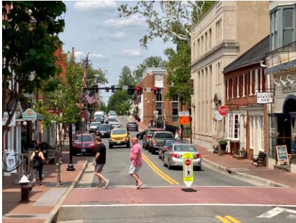
Town of Leesburg's Main Street Exploration Project