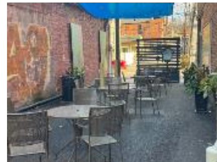
St. Paul Tomorrow, Inc.'s Outdoor Dining & Alleyway Improvement Project