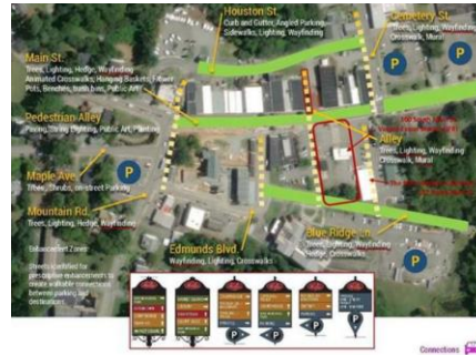
Town of Halifax's Downtown Connections Project