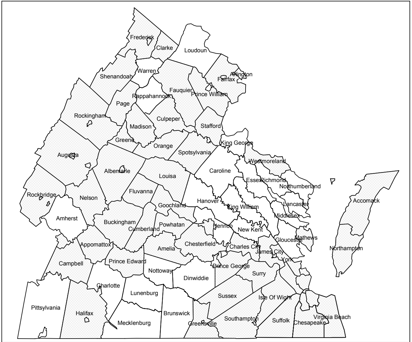
Figure 401.4(2) MODERATE & HIGH SHRINK-SWELL RATINGS BY COUNTY IN THE STATE OF VIRGINIA

Note: See Figure 401.4(1) for legend and notes.